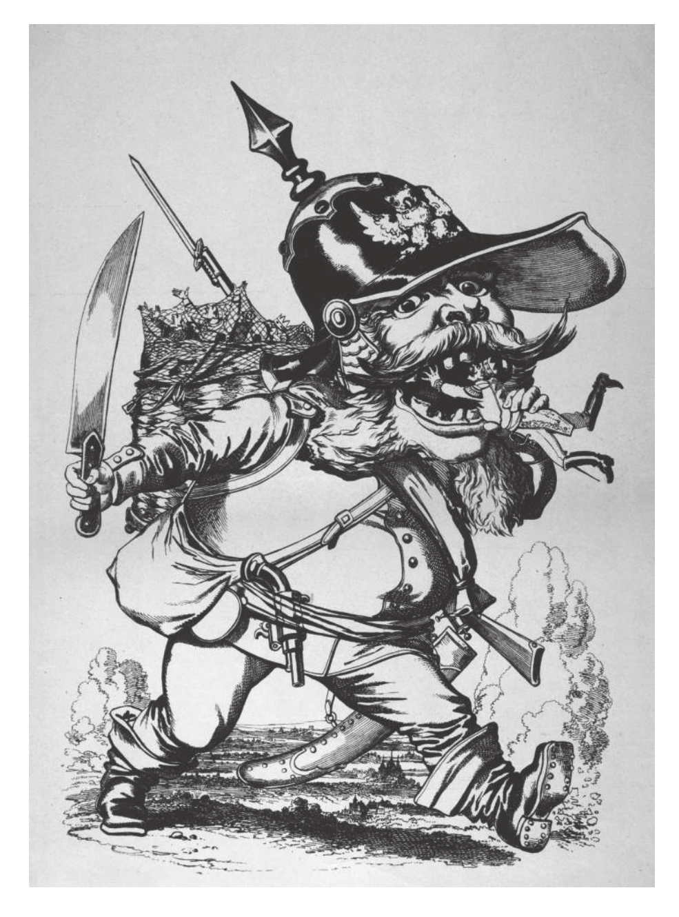
A French cartoon published in early 1867. It is entitled 'The Giant German Ogre'. It shows William and some small figures which represent the princes of North Germany.