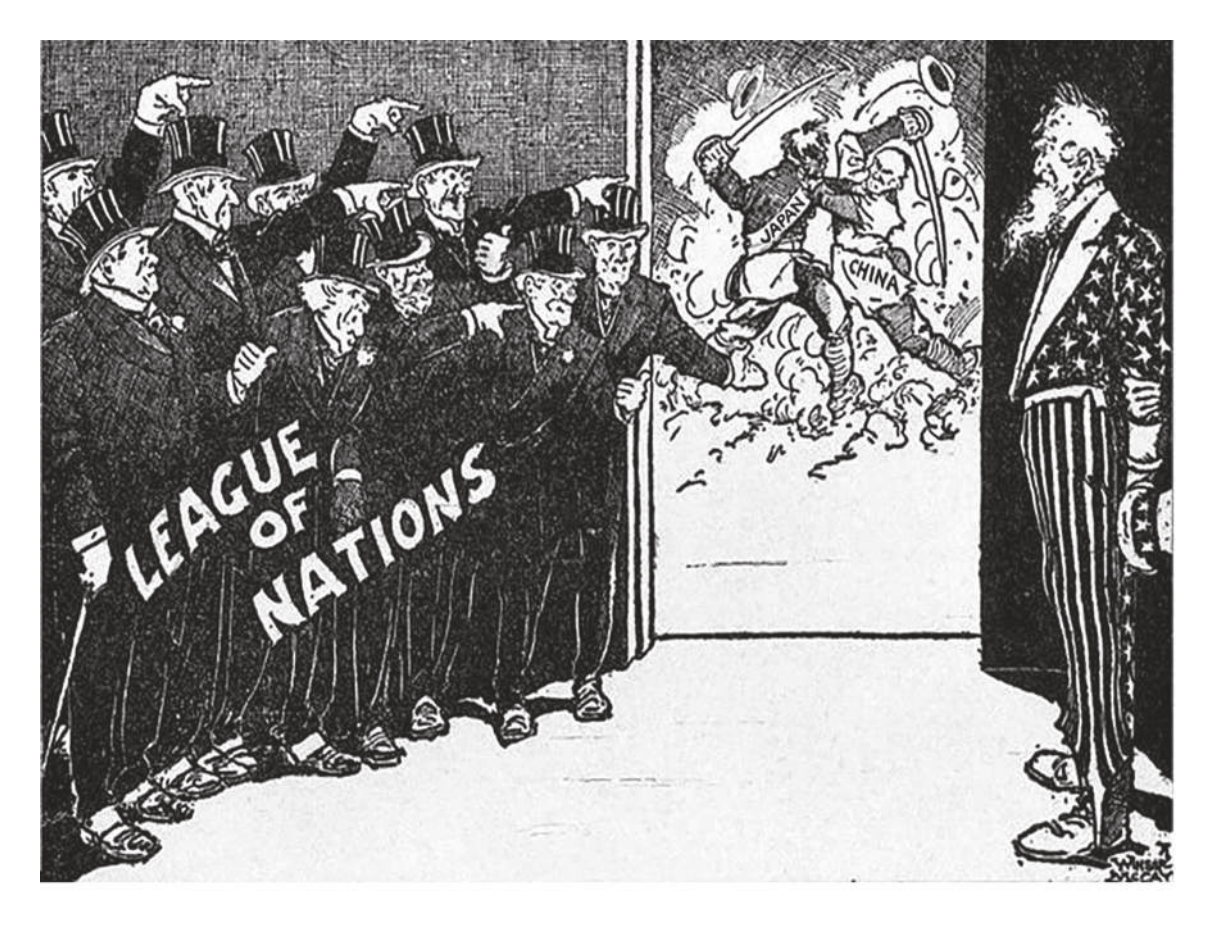
A cartoon published in 1932. The two figures fighting represent Japan and China.